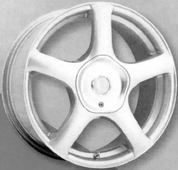
ALPINE 402(S) Silver FWD 16, 17, 18