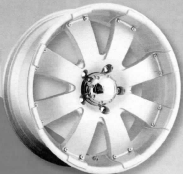
MAKO 243(S) Silver RWD 16, 17, 18, 20