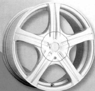
SLALOM 403(S) Silver FWD 14, 15, 16, 17, 18