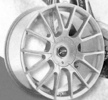
MARATHON 401(S) Silver FWD 16, 17, 18